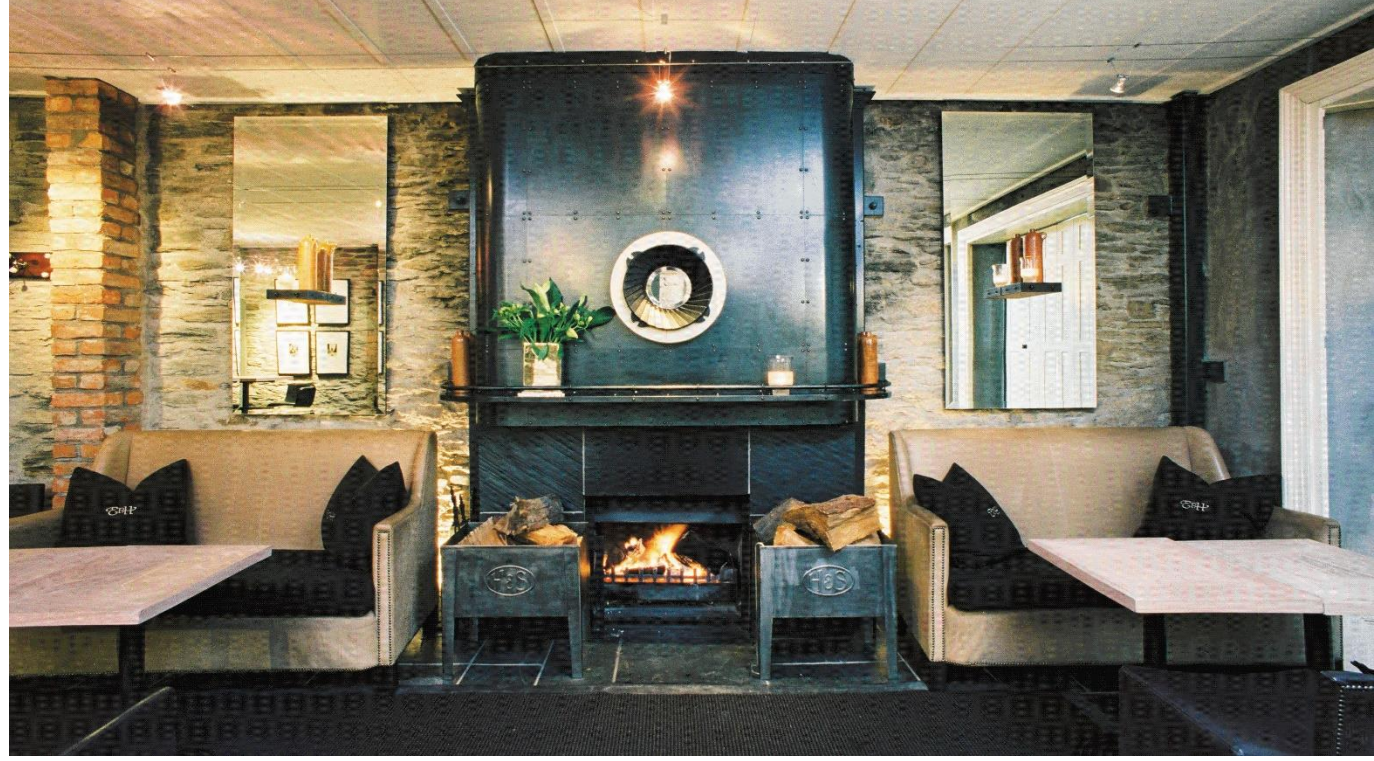
Tee off in New Zealand | 14 days / 13 nights