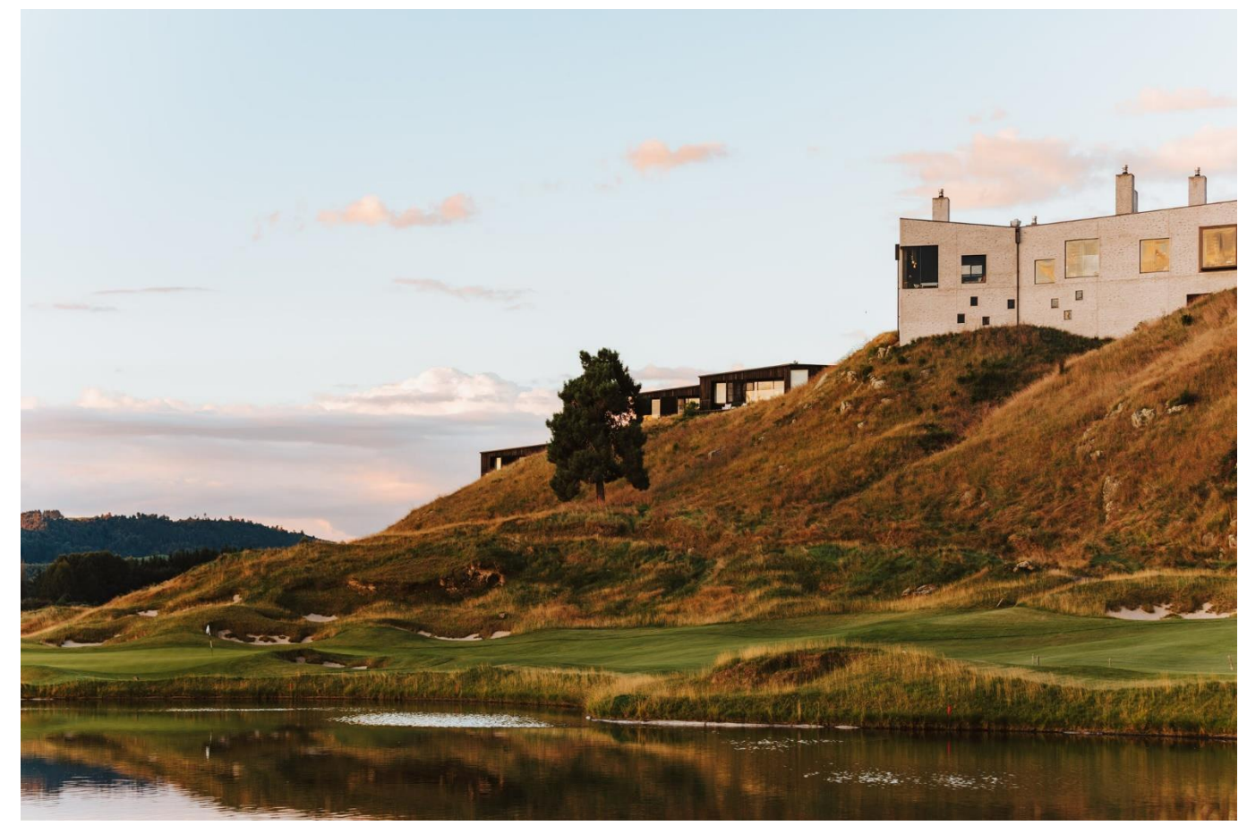
Tee off in New Zealand | 14 days / 13 nights