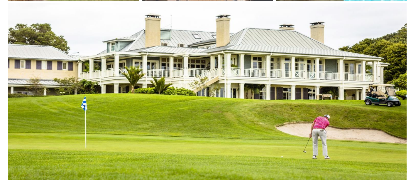
Tee off in New Zealand | 14 days / 13 nights