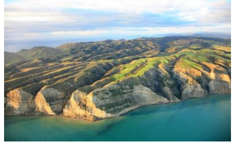
Tee off in New Zealand | 14 days / 13 nights