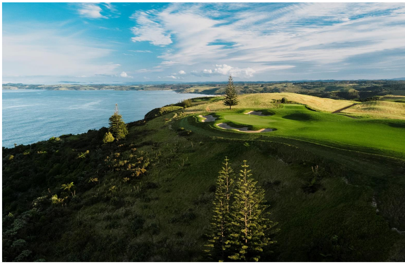
Tee off in New Zealand | 14 days / 13 nights