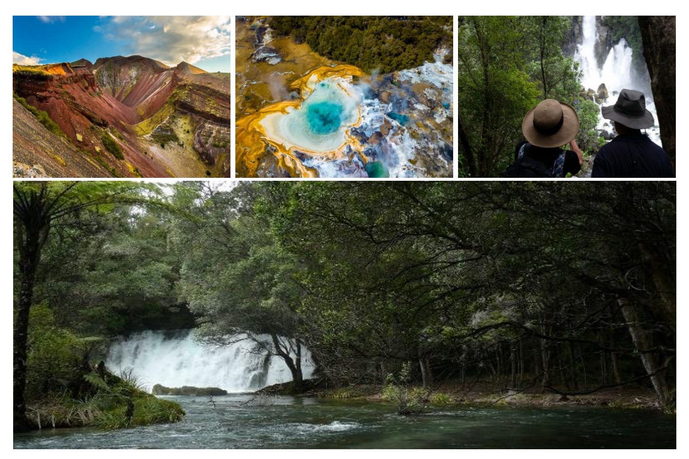
Quintessentially New Zealand | 20 days / 19 nights