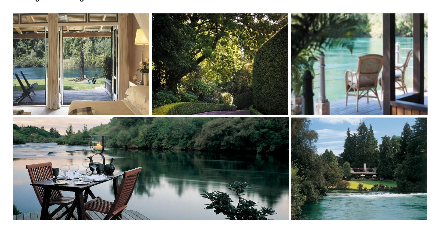
Overnight Huka Lodge: Breakfast and Dinner

Scheduled flight from Auckland Airport Domestic Terminal to Taupo Airport Complimentary vehicle transfer by lodge representative to Huka Lodge *15mins